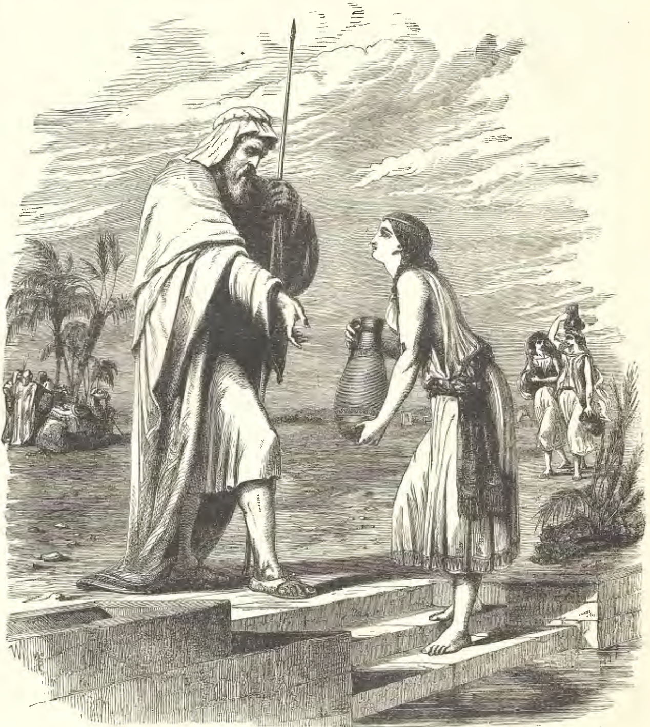
ABRAHAM'S SERVANT MEETING REBEKAH AT THE WELL.

that she was indeed the bride chosen for Isaac by God, and presented her with rich jewels. Rebekah hastened to her father's house, and told them of the arrival of the stranger, who was invited to become the guest of the family. He accepted the invitation, and at once stated his errand; making, in his master's name, a formal proposition for the hand of Rebekah, and relating the divine assistance by which he had been enabled to recognize her. The proposed alliance proving acceptable to the maiden and to her family, the servant escorted her to the home of Isaac, who dwelt by the well of La-hai-roi , in the