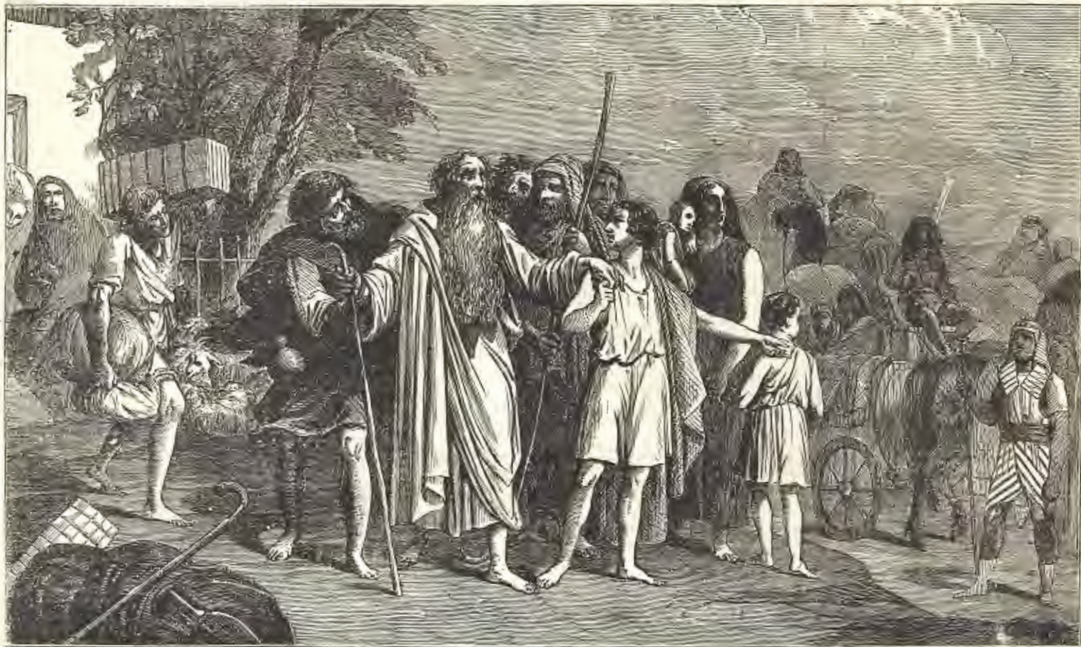
JACOB SETTING OUT FOR EGYPT.

the powerful minister of a mighty king. He affected great harshness toward them, and greatly terrified them, but, as the sequel proved, this was done only to gain over them the power he was ready to use for their good. Benjamin having been sent down to Egypt in accordance with Joseph's demand, the latter determined to put into effect a stratagem which should test the strength of his brethren's affection for Benjamin. To effect this design, he ordered his steward to fill his brethren's sacks with corn, and to put every man's money in his