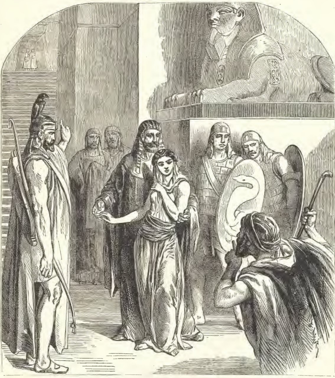
SARAH TAKEN FROM ABRAM BY PHARAOH.

That Sarah and Rebekah were beautiful women would seem clear from the precautions taken by their husbands in the instances related, and that the latter were not too partial in their estimates is shown by the admiration displayed by the Philistines and Egyptians. In the case of Sarah it has been thought by some that the commendation which the princes of Pharaoh bestowed upon the charms of the lovely stranger was owing to the contrast which her fresh Mesopotamian complexion offered to the dusky hue of their own beauties. But so far as climate is concerned the nearer Syria could offer complexions as fair as hers; and, moreover, a people trained by their habits to admire "dusky" beauties were not likely to be inordinately attracted by a fresh complexion. It must have been some rare quality of personal beauty which drew the attention of the princes to her, and caused Pharaoh to take her for himself.