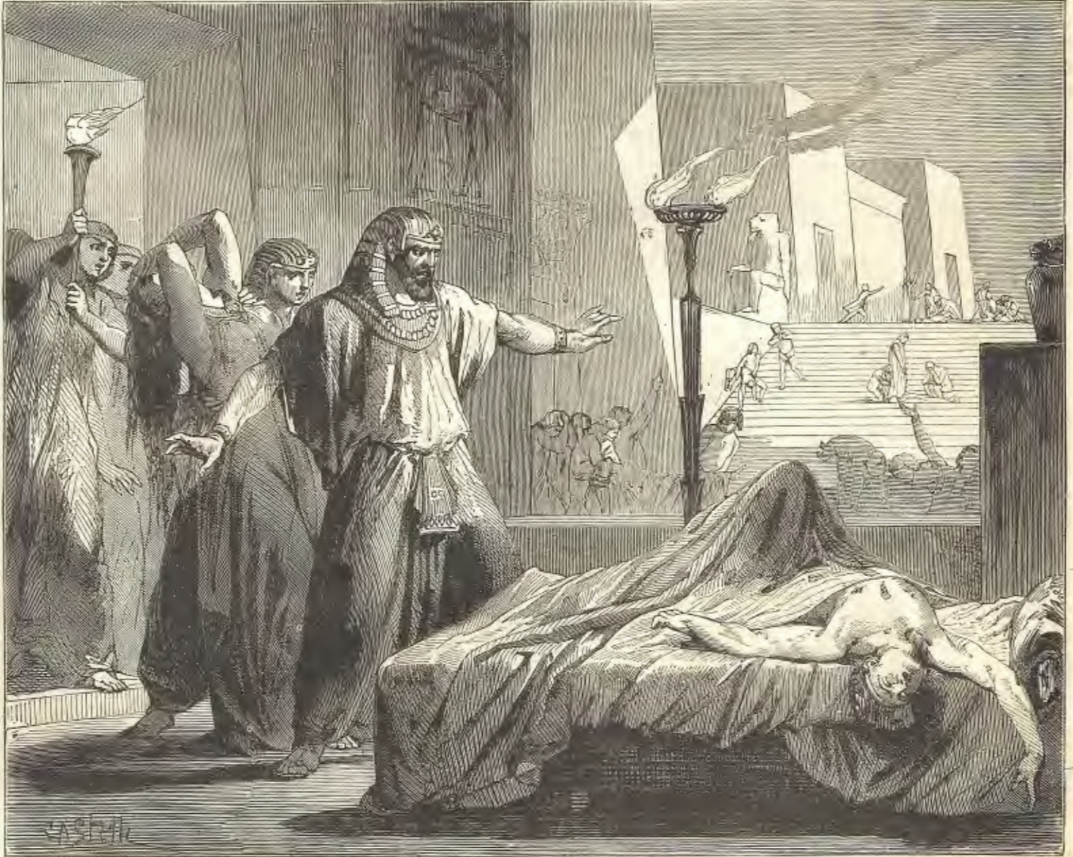
DEATH OF THE FIRST-BORN OF EGYPT.

The departure of the Israelites from Egypt closed the 430 years of their pilgrimage, which began from the call of Abram out of Ur of the Chaldees. Having learned the discipline of God's chosen family, and