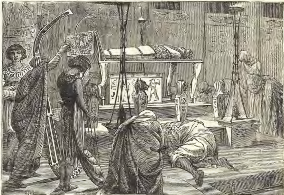
EMBALMING THE BODY OF JOSEPH.

JOSEPH, after making himself known to his brethren during their last journey to Egypt to buy corn, addressed himself to the task of bringing his father and family down to Egypt, where he could provide for their temporal wants. He sent wagons, provisions, and attendants to Palestine, in order that his father and the wives and children of his brethren might make the journey in comfort. When Jacob heard that his long lost son was a rich and powerful prince, the Viceroy of the great King of Egypt, who was at that time the sovereign