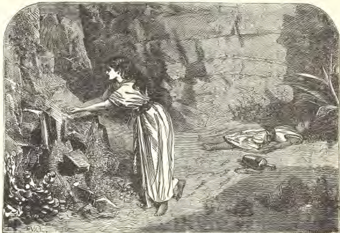
HAGAR AND ISHMAEL IN THE DESERT.

DURING the first part of Abram's sojourn in Canaan, his nephew Lot dwelt with him. They became so wealthy that the land could not support Abram's cattle and Lot's, and their herdsmen were continually quarrelling. They decided to separate, and Abram, remembering that he was "the heir of better promises," gave the choice of the land to Lot. Their encampment looked westward on the rugged hills of Judæa and eastward on the fertile plain of the Jordan about Sodom. It was exactly the prospect to tempt a man who had no fixed purpose of his own, who had not, like Abram, obeyed a stern inward call of duty. So Lot left his uncle on the barren hills of Bethel, and chose all the precinct of the Jordan and journeyed east. Abram received his reward in a third blessing and promise from God, who bade him lift up his eyes and scan the whole land on every side, for it should be the possession of his seed. Abram now removed to the Oaks of Mamre, near Hebron, which became his usual abode. (Gen. xiii. 5-18.)