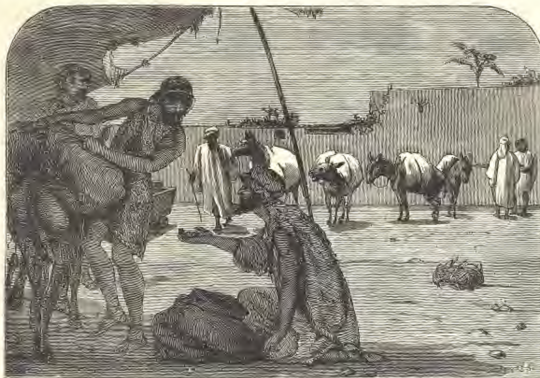
THE SONS OF JACOB FINDING THEIR MONEY IN THEIR SACKS.

had devoured Joseph, and the merchants went on to Egypt, carrying their captive with them. Upon reaching Egypt they sold him to Potiphar, the captain of Pharaoh's guard. Joseph was seventeen years old at this time (Gen. xxxvii. 12-36).