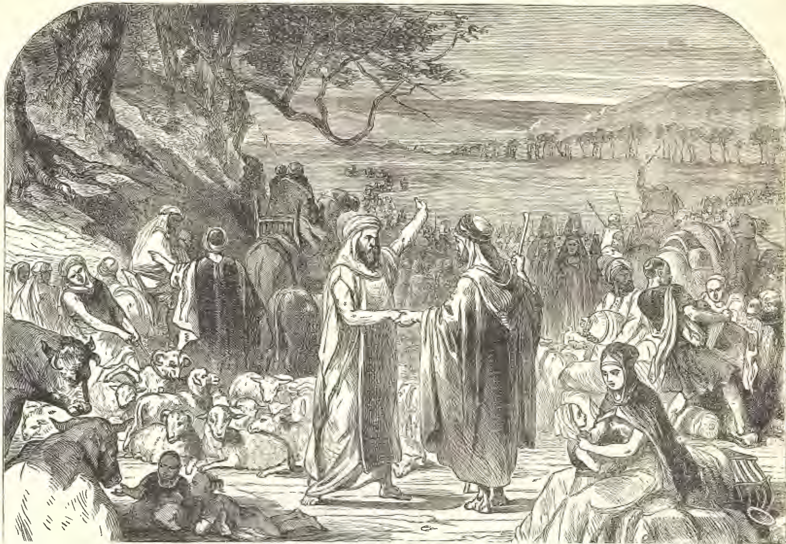
THE SEPARATION OF ABRAM AND LOT.

DURING the first part of Abram's sojourn in Canaan, his nephew Lot dwelt with him. They became so wealthy that the land could not support Abram's cattle and Lot's, and their herdsmen were continually quarrelling. They decided to separate, and Abram, remembering that he was "the heir of better promises," gave the choice of the land to Lot. Their encampment looked westward on the rugged hills of Judæa and eastward on the fertile plain of the Jordan about Sodom. It was exactly the prospect to tempt a man who had no fixed purpose of his own, who had not, like Abram, obeyed a stern inward call of duty. So Lot left his uncle on the barren hills of Bethel, and chose all the precinct of the Jordan and journeyed east. Abram received his reward in a third blessing and promise from God, who bade him lift up his eyes and scan the whole land on every side, for it should be the possession of his seed. Abram now removed to the Oaks of Mamre, near Hebron, which became his usual abode. (Gen. xiii. 5-18.)