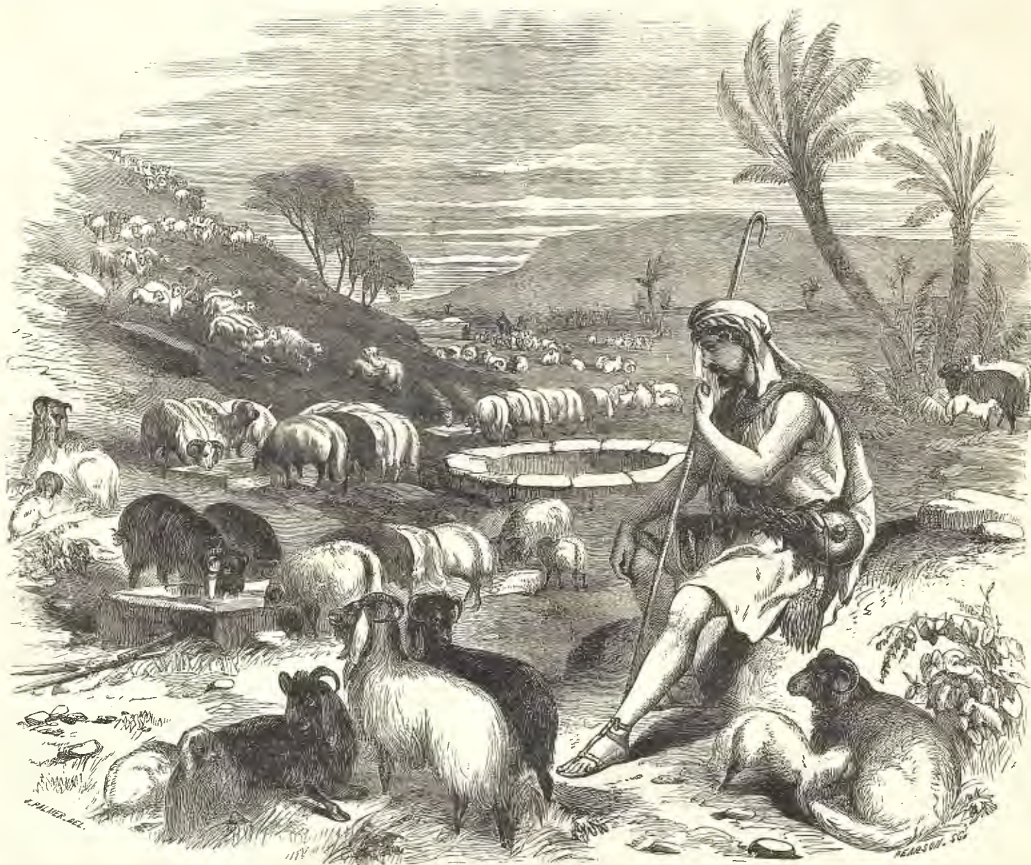
JACOB KEEPING THE FLOCKS OF LABAN.

before, and brought him to her father's house. Jacob was cordially welcomed, and engaged to serve Laban as a shepherd for wages; for it is not the custom with Orientals for even a relative to eat the bread of idleness. Laban had two daughters, Leah and Rachel, the former with some dulness or weakness of the eyes, but the latter of perfect beauty. Jacob loved Rachel, and agreed to serve for her seven years, "which seemed unto him but a few days for the love he had to her." When he claimed his reward, Laban, by a trick rendered easy by the forms of an Eastern wedding, where the bride is closely veiled, gave him Leah in place of Rachel, and excused the deceit by the impropriety of marrying the younger sister before the older; but he gave Jacob Rachel also, on the condition of another seven years' service.