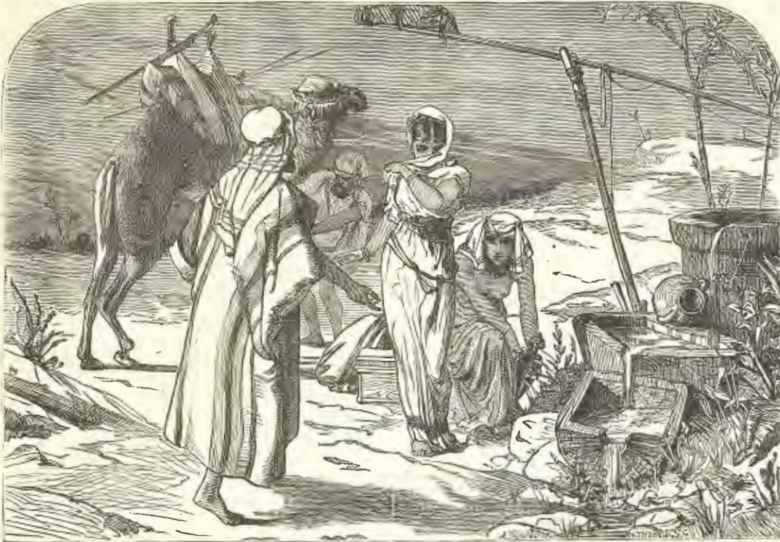
THE MEETING OF ISAAC AND REBEKAH.

by God, without "despising" God who gave them. But more than this: he was the head of the chosen family; on him devolved the blessing of Abraham, that "in his seed all the families of the earth should be blessed;" and, in despising his birthright, he put himself out of the sacred family, and so became "a profane person." His sin must not be overlooked in our indignation at the fraud of Jacob, which brought its own retribution as well as its own gain. Having thus secured his brother's inheritance, Jacob was enabled, through the connivance of his mother, to supplant him at the most critical moment of his life, and to obtain by fraud from their father the blessing of Abraham, which he was to hand down to another generation—an inheritance which involved a higher and spiritual blessing, including, in addition to all temporal prosperity, a dominion so universal that it could only be fulfilled by the Kingdom of the Messiah (Gen. xxv., xxvii.) The moral aspect of this transaction is plain to those who remember that the patriarchs are represented in the Bible as "men compassed with infirmity, favored by the grace of God, but not at all endowed