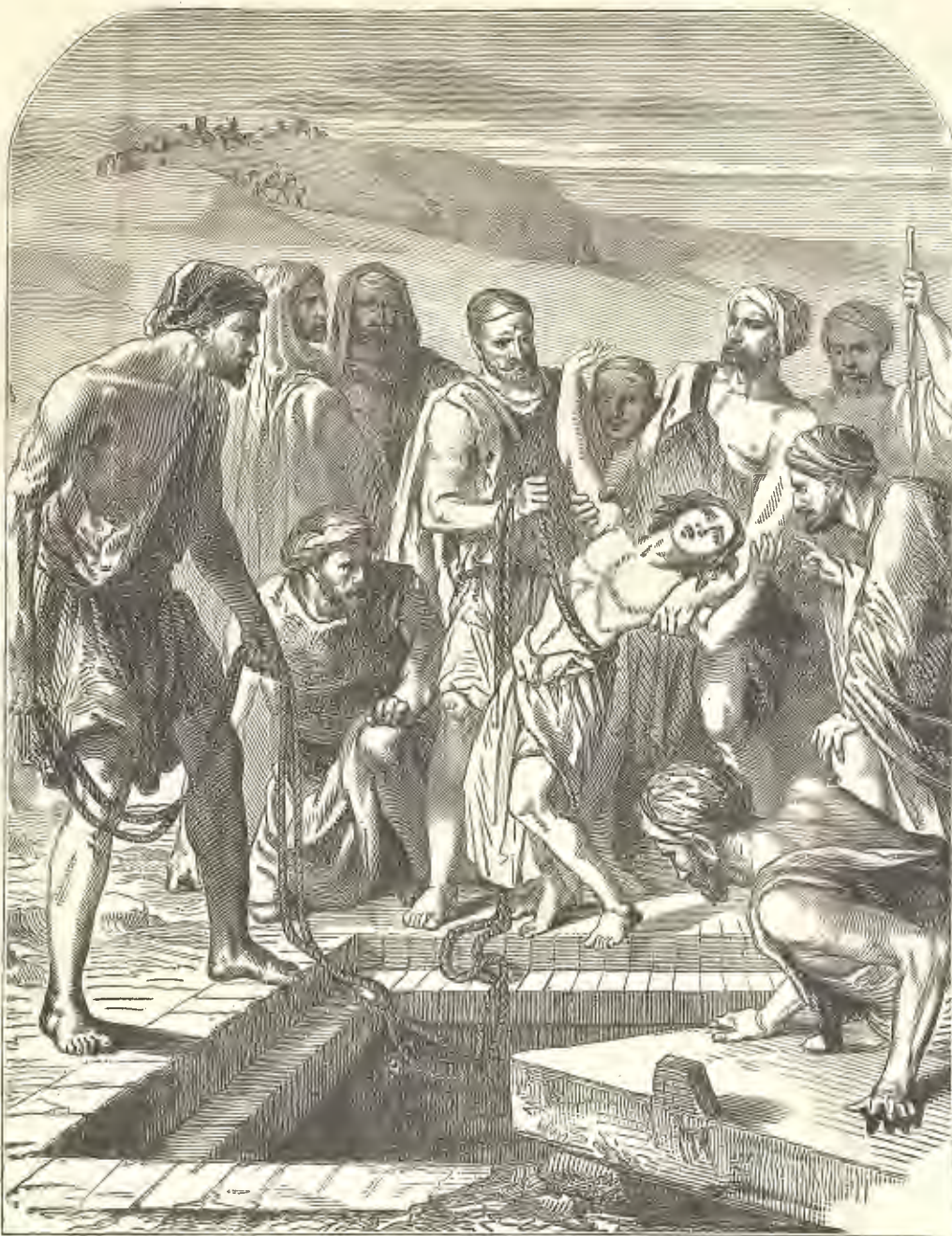
JOSEPH CAST INTO THE PIT BY HIS BRETHREN.

THE hatred of the sons of Jacob of their brother Joseph culminated in a determination to take his life. The occasion they sought soon presented itself. Jacob was sojourning with his father, Isaac, at Hebron, and had sent his ten sons to feed the flocks at Shechem. Being anxious to hear how they fared, he sent Joseph to them with a loving message. Upon reaching Shechem, Joseph found that his brethren had gone on to Dothan, a place in the neighborhood, and he hastened after them. They recognized him at a distance, and resolved to kill him as soon as he came up. Reuben opposed their bloody design, and