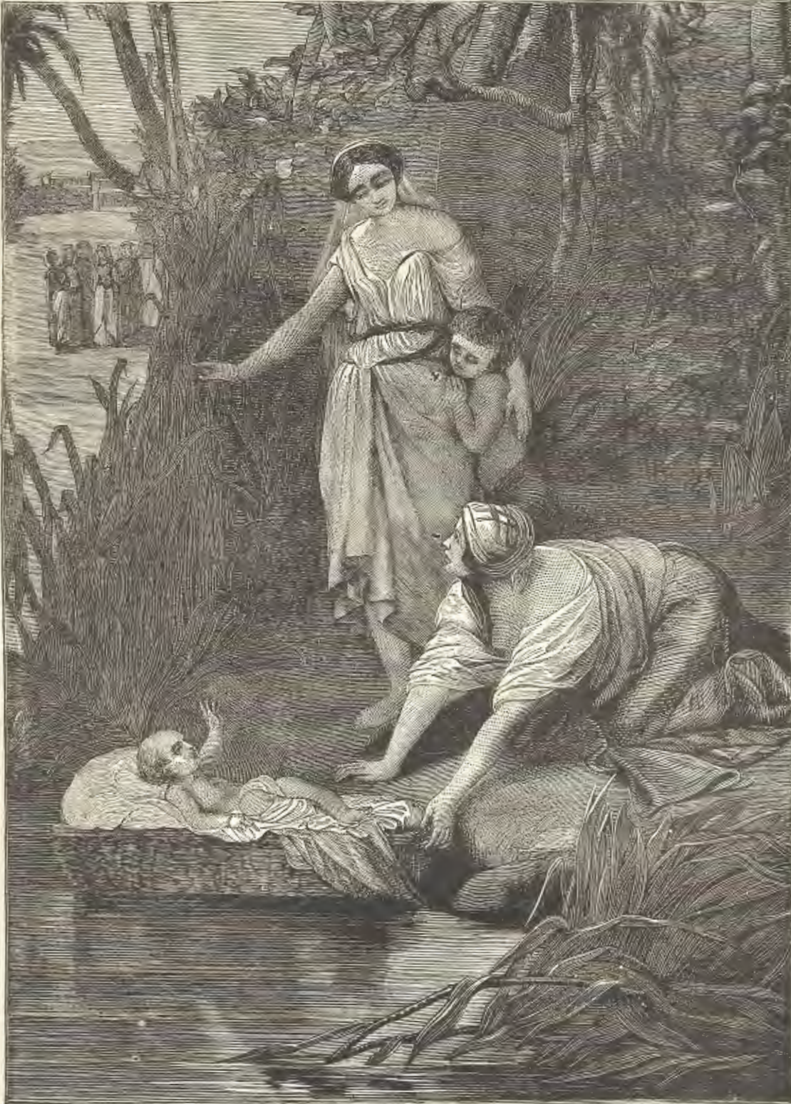
THE FINDING OF MOSES BY PHARAOH'S DAUGHTER.

water-proof basket, in which she placed the babe, and laid it among the rushes that grew along the banks of the Nile. Then she went back to her home, leaving Miriam to watch the fate of the babe. The daughter of the king of Egypt, coming down to the river to bathe, discovered the babe, took compassion on him, adopted him as her own son, and gave him to his mother to nurse for her. He grew up to manhood at the court of Pharaoh, and was instructed in all the learning of the Egyptians. He was given the name of Moses (Ex. ii. 1-10). St. Stephen declares that Moses was "mighty in words, and in deeds;" and whatever we may think of the traditions about this period of his life, it was certainly a part of his training for his great mission as the leader of and legislator for the chosen people of God. The traditions respecting his earlier life are very interesting. He is said to have been educated at Heliopolis as an Egyptian priest, and taught the whole range of Egyptian, Chaldee, Assyrian, and Greek literature. Another tradition states that he took part in an impor-