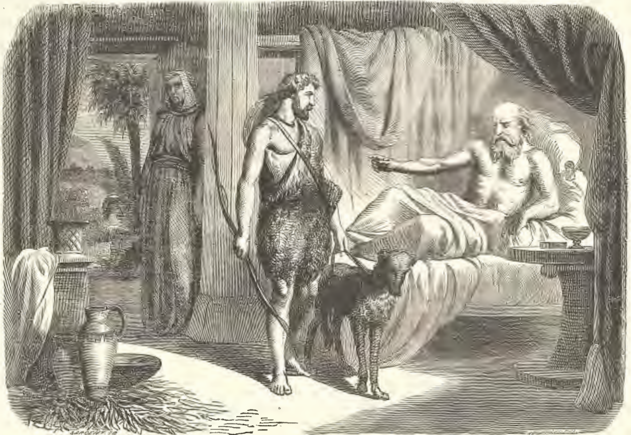
ESAU GOING FOR VENISON.