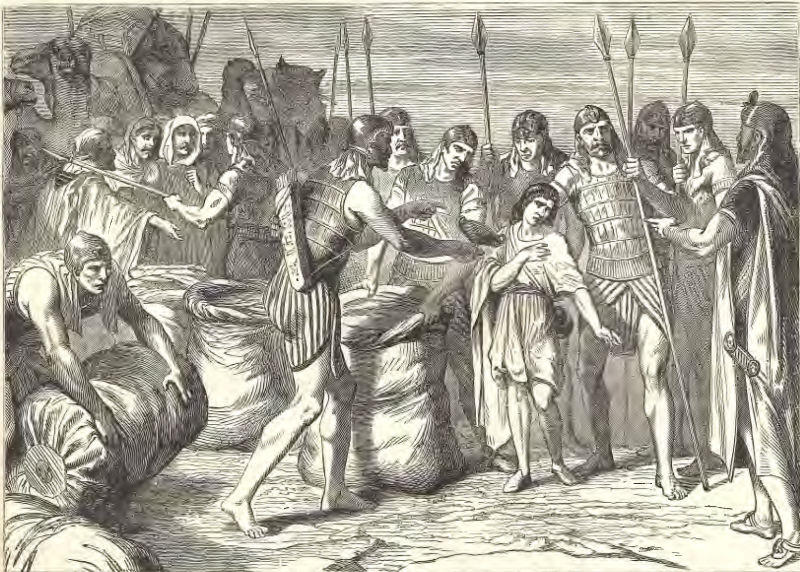
THE CUP FOUND IN BENJAMIN'S SACK.

THE adventures of Joseph in Egypt, and the events which gained him the favor of Pharaoh, are known to all readers of the Bible. He became the chief minister of the great king, and rose to the second place in the kingdom. Having predicted the terrible famine, he prepared for it with so much wisdom and vigor that when the neighboring countries were suffering the keenest want, the kingdom of Pharaoh was abundantly supplied, and able even to furnish food to its neighbors. The famine lasted seven years, and the corn of Palestine became exhausted, and Jacob was obliged to send his sons into Egypt to buy corn. Benjamin, the youngest, he kept at home. The sons of Jacob reached Egypt, and Joseph at once recognized his brethren, but they failed to recognize him, and fulfilled his first dream by doing humble homage to him, as