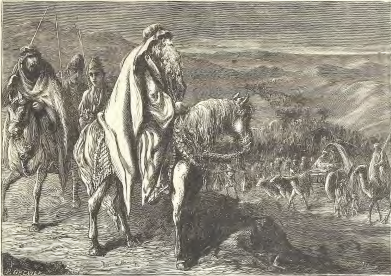
JACOB'S RETURN TO THE PROMISED LAND.

enmity. To add to their hostility, Joseph dreamed two dreams, which even his father, who seems to have discerned their prophetic character, censured his imprudence in repeating. In the first dream his brothers' sheaves of corn bowed down to his, which stood upright in their midst; a most fit type not only of their submission to him, but of their suing to him for corn in Egypt. The second dream was of a wider and higher import. It included his father and his mother, as well as his brethren, in the reverence done to him; and the emblems chosen leave little doubt that the dream prefigured the homage of all nature to Him whose sign was the Star of Bethlehem, and of whom Joseph was one of the clearest types (Gen. xxxvii. 1-11). It has been supposed by some commentators, from Jacob's language respecting Joseph's second