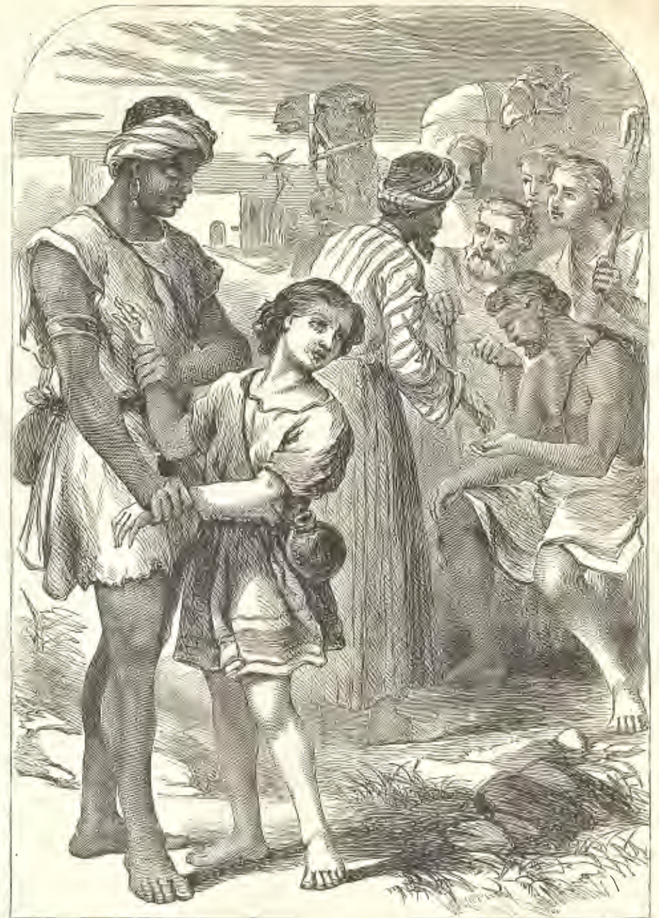
JOSEPH SOLD BY HIS BRETHREN.

THE hatred of the sons of Jacob of their brother Joseph culminated in a determination to take his life. The occasion they sought soon presented itself. Jacob was sojourning with his father, Isaac, at Hebron, and had sent his ten sons to feed the flocks at Shechem. Being anxious to hear how they fared, he sent Joseph to them with a loving message. Upon reaching Shechem, Joseph found that his brethren had gone on to Dothan, a place in the neighborhood, and he hastened after them. They recognized him at a distance, and resolved to kill him as soon as he came up. Reuben opposed their bloody design, and