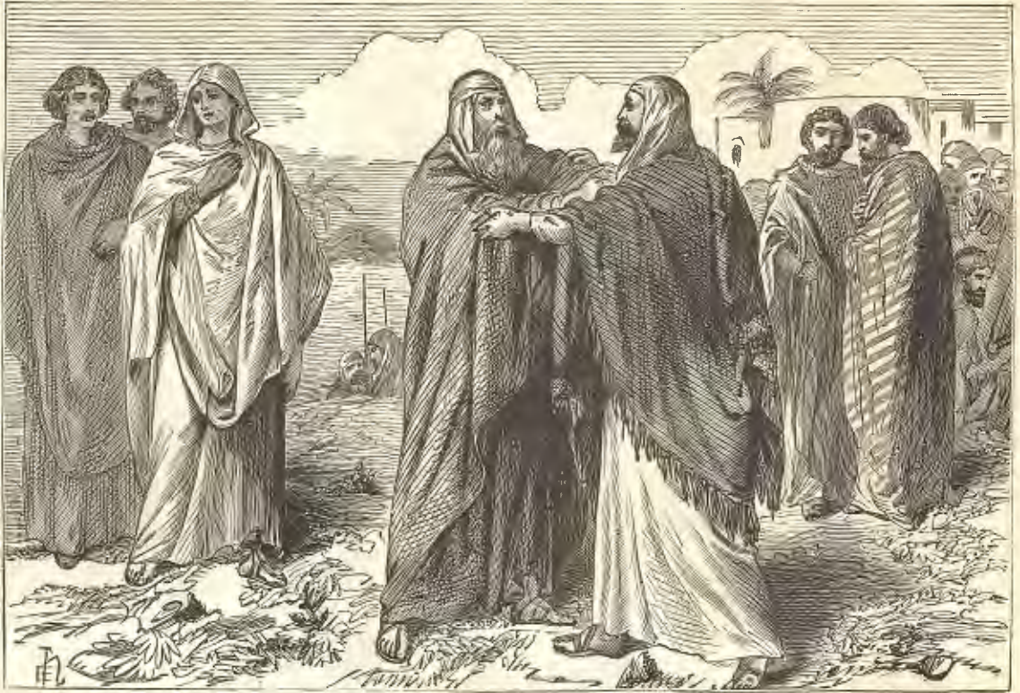
THE MEETING OF MOSES AND JETHRO.

the Ark during its captivity among the Philistines, after the conquest and occupation of the Promised Land, and were brought up to