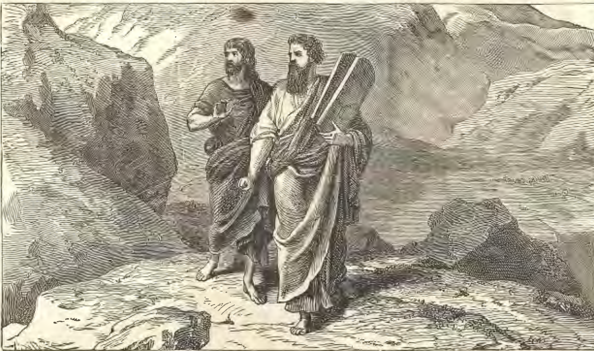
MOSES AND JOSHUA BEARING THE LAW.

of their days of trial, of the all-powerful goodness, and the great love of Jehovah, who had made of the fugitives from Egypt a great and powerful nation, feared and respected by their neighbors, and the happiest of all the races of the ancient world. When Solomon's Temple was destroyed by the Babylonians at the capture of Jerusalem by Nebuchadnezzar, the Ark and the Tables of the Law were doubtless destroyed. No further mention is made of them after this event. It was impossible that the sacred Ark and its contents should have escaped the general ruin, and we are warranted in believing that under no circumstances would the Almighty have suffered them to become the trophies of a pagan conqueror. Had they been taken, mention would have been made of them; but the Bible and profane history are silent concerning them. We can feel