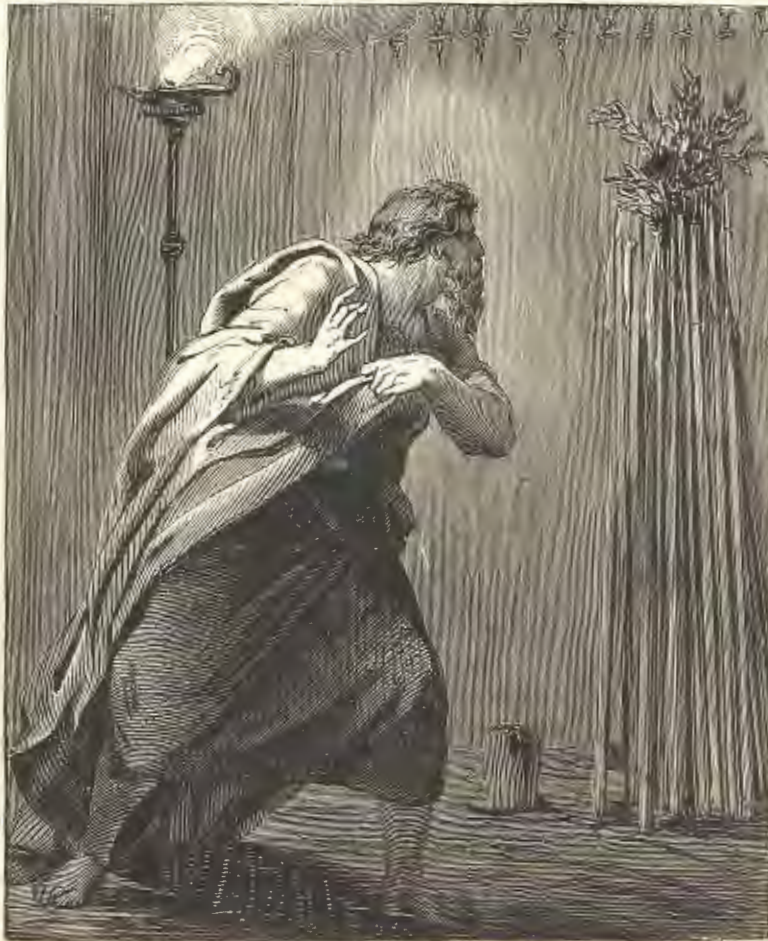
AARON'S ROD THAT BUDDED.

DURING his abode on Mount Sinai, Moses received from the Almighty full directions as to the construction and adornment of the tabernacle. Then, all things being thus prepared, Moses was commanded to set up the Tabernacle, and place in it the Ark of the Covenant, and to anoint Aaron and his sons to the priesthood. The solemn ceremony took place on the first day of the first month of the second year from the epoch of the Exodus, March to April, B. C. 1490. The priesthood was confined to the family of Aaron, who alone could offer sacrifices (Ex. xl. 12-16). The form of consecration resembled other sacrificial ceremonies in containing, first, a sin offering, the form of cleansing from sin and reconciliation; a burnt offering, the symbol of entire devotion to God of the nature so purified; and a meat offering, the thankful acknowledgment and sanctifying of God's natural blessings. It had, however, besides these, the solemn assumption of the sacred robes (the garb of righteousness), the anointing (the symbol of God's grace), and the offering of the ram of consecration, the blood of which was sprinkled on Aaron and his sons, as upon the altar and vessels of the ministry, in order to sanctify them for the service of God. The former cere-