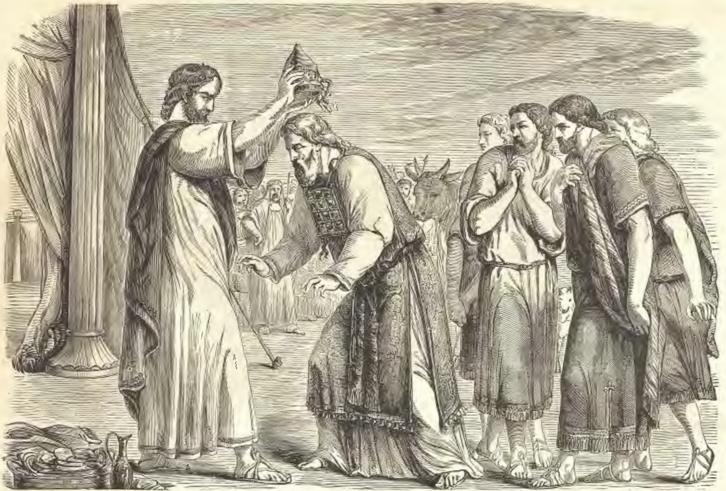
CONSECRATION OF AARON AND HIS SONS.

DURING his abode on Mount Sinai, Moses received from the Almighty full directions as to the construction and adornment of the tabernacle. Then, all things being thus prepared, Moses was commanded to set up the Tabernacle, and place in it the Ark of the Covenant, and to anoint Aaron and his sons to the priesthood. The solemn ceremony took place on the first day of the first month of the second year from the epoch of the Exodus, March to April, B. C. 1490. The priesthood was confined to the family of Aaron, who alone could offer sacrifices (Ex. xl. 12-16). The form of consecration resembled other sacrificial ceremonies in containing, first, a sin offering, the form of cleansing from sin and reconciliation; a burnt offering, the symbol of entire devotion to God of the nature so purified; and a meat offering, the thankful acknowledgment and sanctifying of God's natural blessings. It had, however, besides these, the solemn assumption of the sacred robes (the garb of righteousness), the anointing (the symbol of God's grace), and the offering of the ram of consecration, the blood of which was sprinkled on Aaron and his sons, as upon the altar and vessels of the ministry, in order to sanctify them for the service of God. The former cere-