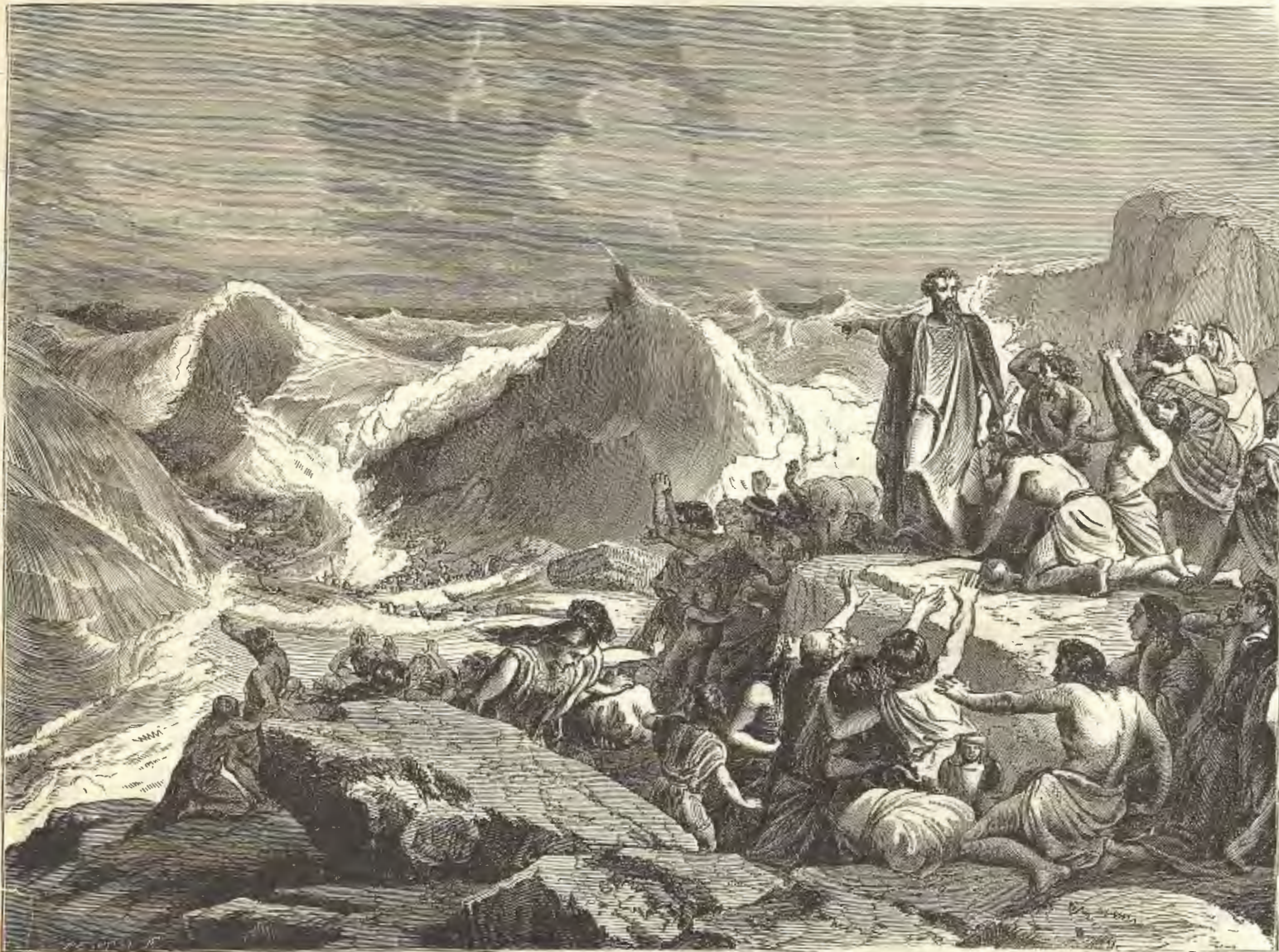
THE DESTRUCTION OF PHARAOH'S ARMY IN THE RED SEA.

The sacred narrative says: "And the Egyptians pursued, and went in after them to the midst of the sea, even all Pharaoh's horses, his chariots, and his horsemen. . . . And the waters returned, and covered the chariots and the horsemen, and all the hosts of Pharaoh that came into the sea after them; there remained not so much as one of them" (Ex. xiv. 23-28). It seems that the language italicized makes the true meaning of the Bible narrative plain. Pharaoh was pursuing the Israelites with an army, the strength of which is shown by its having 600 chariots, which in those days corresponded to the artillery of modern times. Such a force of chariots required a corresponding force of infantry and cavalry. Pharaoh found the Israelites encamped on the shore of the Red Sea. On their right the range of Jebel-Atakah cut off their retreat, and in their front was the sea, too deep to be forded. The Egyptian army promptly seized every line of