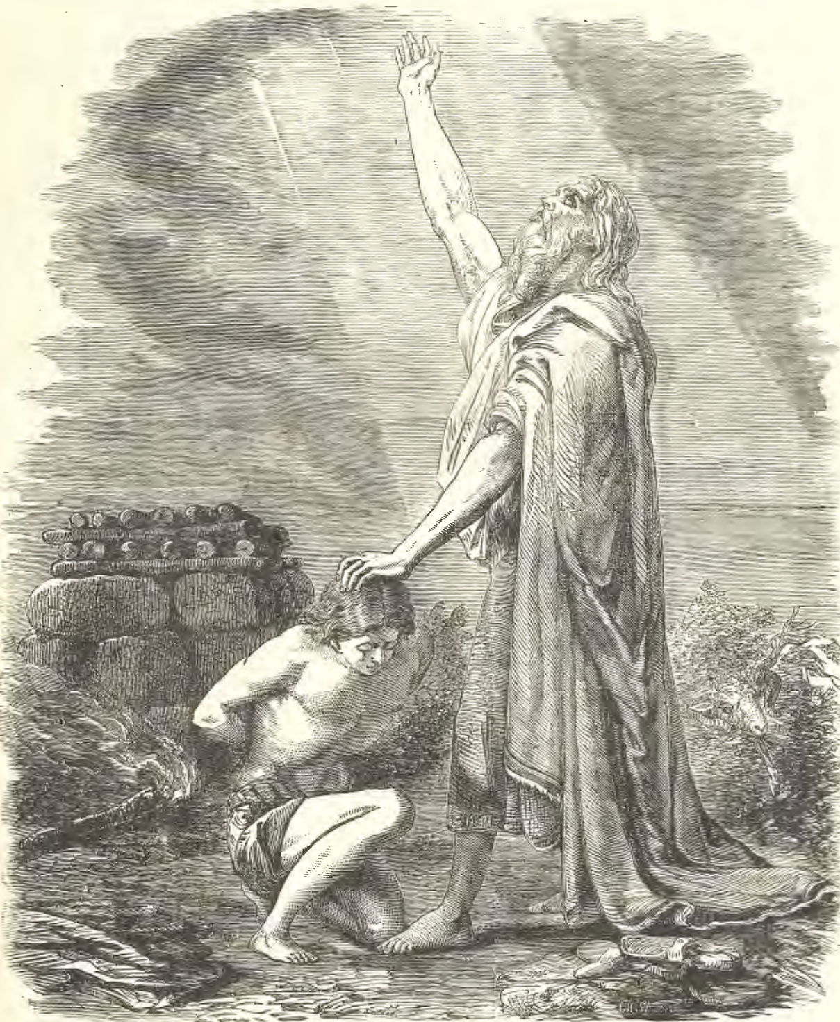
ABRAHAM PREPARING TO SACRIFICE ISAAC.

There would seem to be strong grounds for doubting this, however. Except in the case of Salem (Gen. xiv. 18), the name of Abraham does not appear once in connection with Jerusalem. Moreover, Jerusalem is incompatible with the circumstances of the narrative of Genesis xxii. The temple mount cannot be spoken of as a conspicuous eminence. If Salem was Jerusalem, then the trial of Abraham's faith, instead of taking place in the desolate spot implied by the narrative, actually took place under the very walls of the city of Melchizedek.