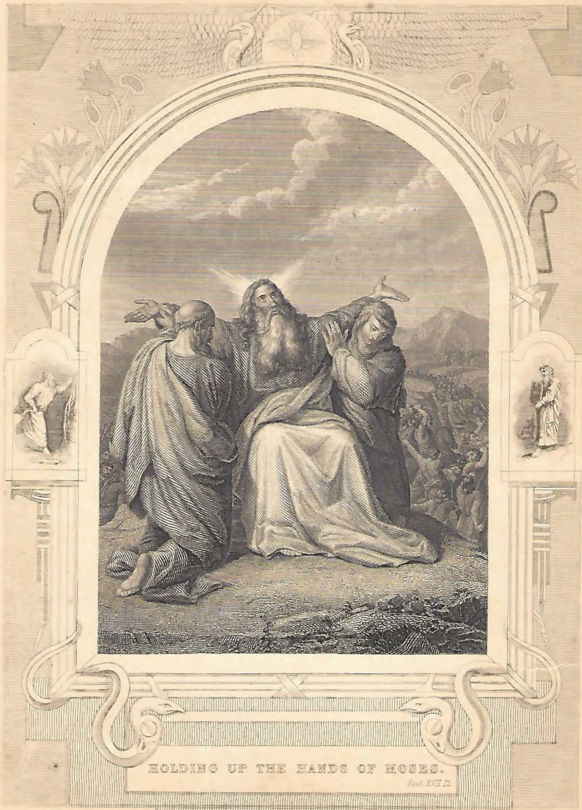
HOLDING UP THE HANDS OF MOSES.